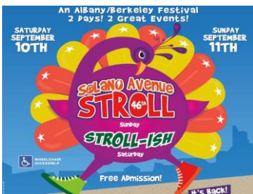
Solano Stroll Poster, 2022