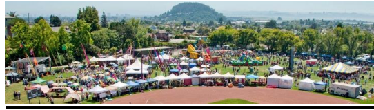
El Cerrito July 4th Celebration, Cerrito Vista Park, 2017

City of El Cerrito. 10890 San Pablo Ave. 510-215-4300. https://www.el-cerrito.org/ Some public events are again being held in person; others use Zoom. Tours of El Cerrito's LEED Platinum Certified Recycling Center are once again offered, at 3:00pm on the first Wednesday of each month.