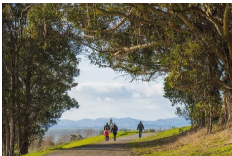
Point Pinole Regional Shoreline EC Trail Trekkers Hike